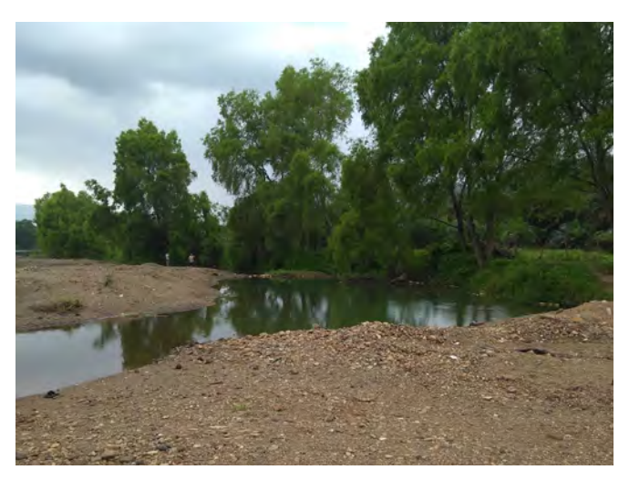
This river is contaminated.

Leaders in the community heard about the work that Living Water International was doing in Honduras. They began to believe that the