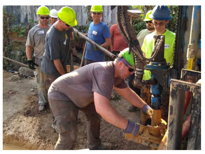
The Living Water Trips team is hard at work.

to return to the community with a drilling rig and a Living Water Trips team. The Living Water team drilled 24 meters into the earth to access an aquifer of safe water. They flushed the borehole of sedimentary debris before installing a PVC pipe, gravel pack, and sanitary seal. They treated the well with a shock chlorination and then tested the water's quality, which proved to be safe for drinking. The team capped the well with a hand pump and laid a concrete base. Finally, the well was complete, and the community members rejoiced!