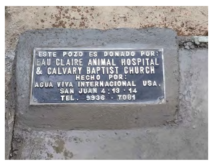
This residents will never forget your generosity!

Thank you for giving water, for life, in Jesus' name!