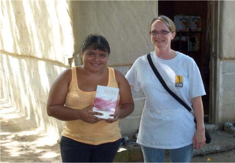
The LWI Honduras team distributed Bibles to community families and shared the Gospel.