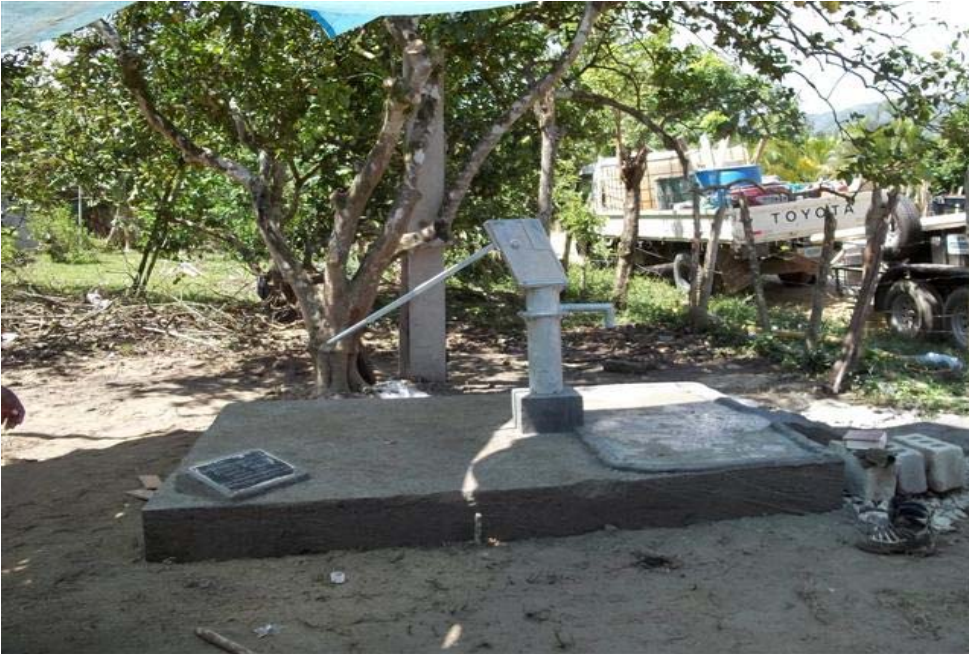
Plaque on pump.