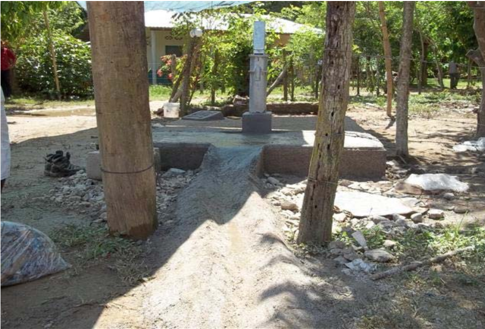
Completed water project.