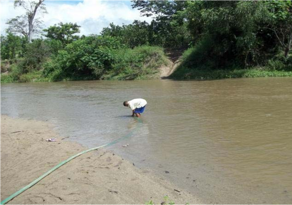
Previous water source and river used by the entire community to meet all of their water needs.