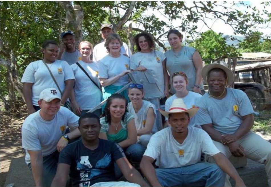
LWI Honduras team.