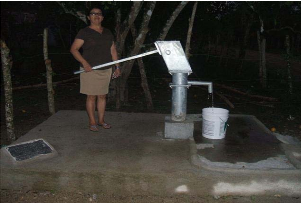
Community member collecting clean drinking water.