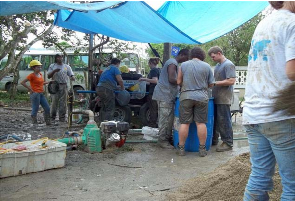
Project in process.