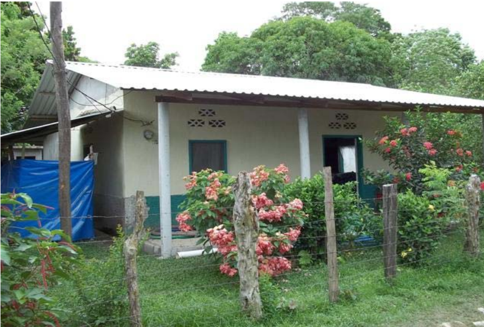
School located half of a kilometer away from the community.