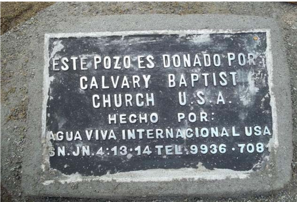
Close up of plaque.