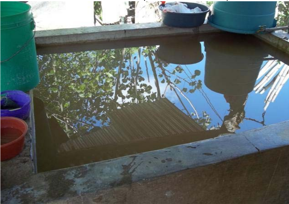
Previous water source.