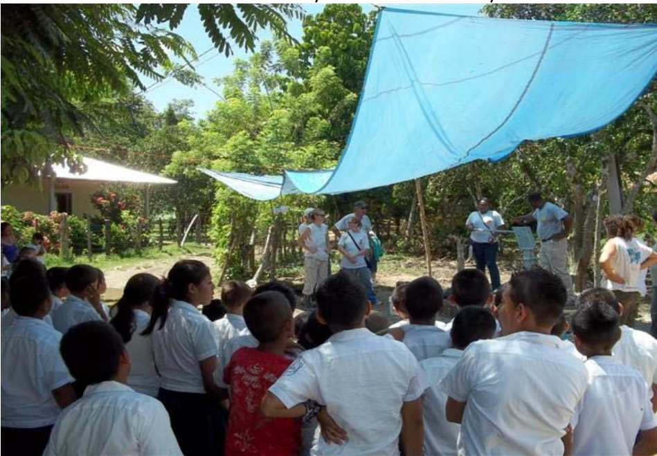
Well dedication ceremony.