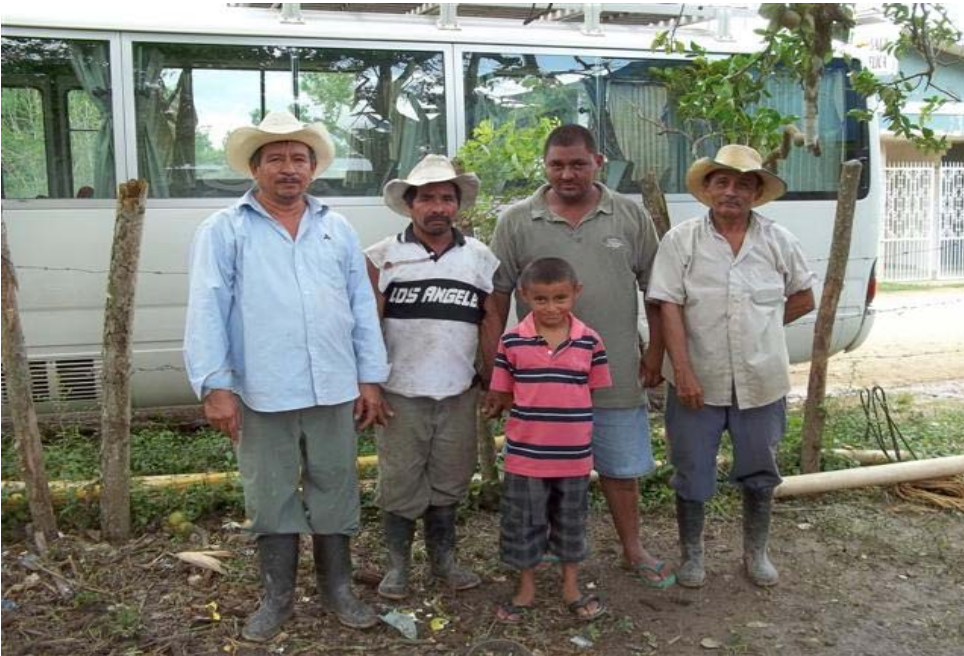
Water committee members who are responsible for helping maintain the well and who were provided with a LWI Honduras contact number in case their well were to fall into disrepair, become subject to vandalism or theft.