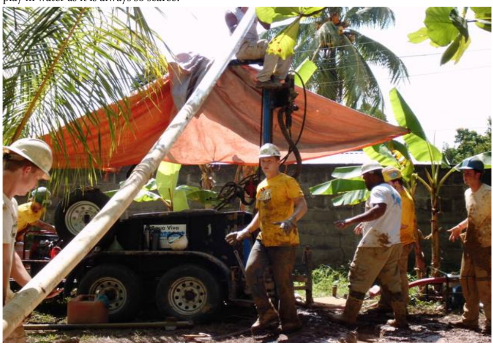
The Living Water Honduras drilling team get ready to install the PVC pipe into the well.