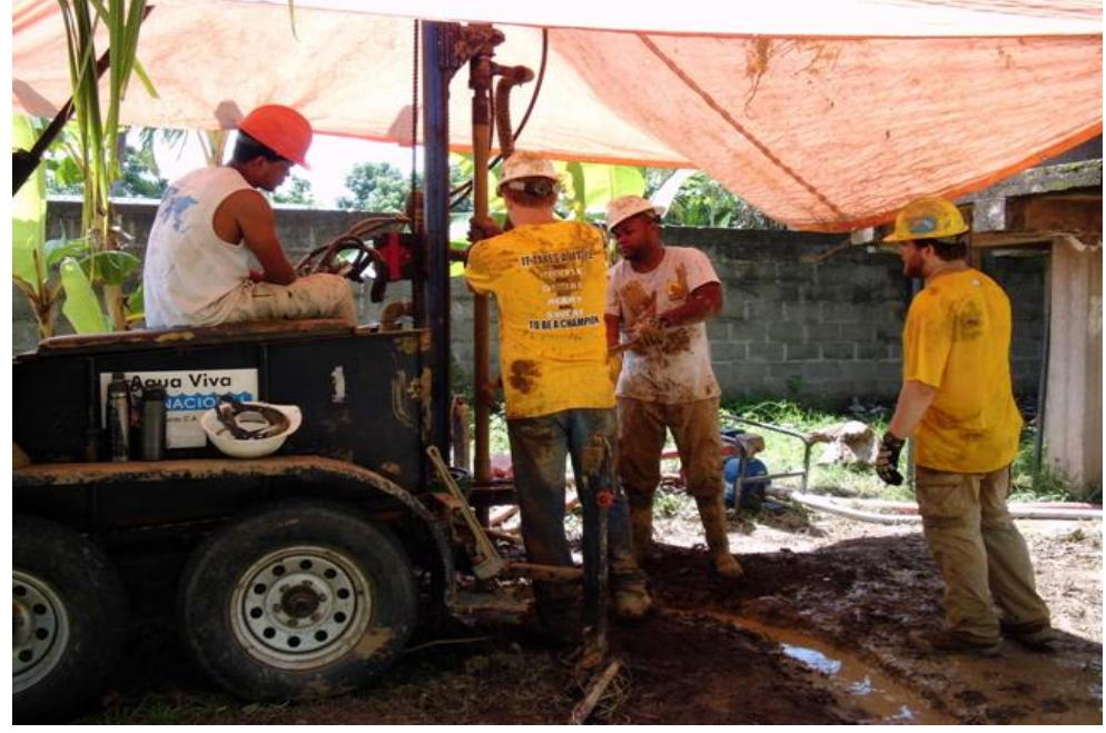
The Living Water Honduras team drilling the new borehole for the community.