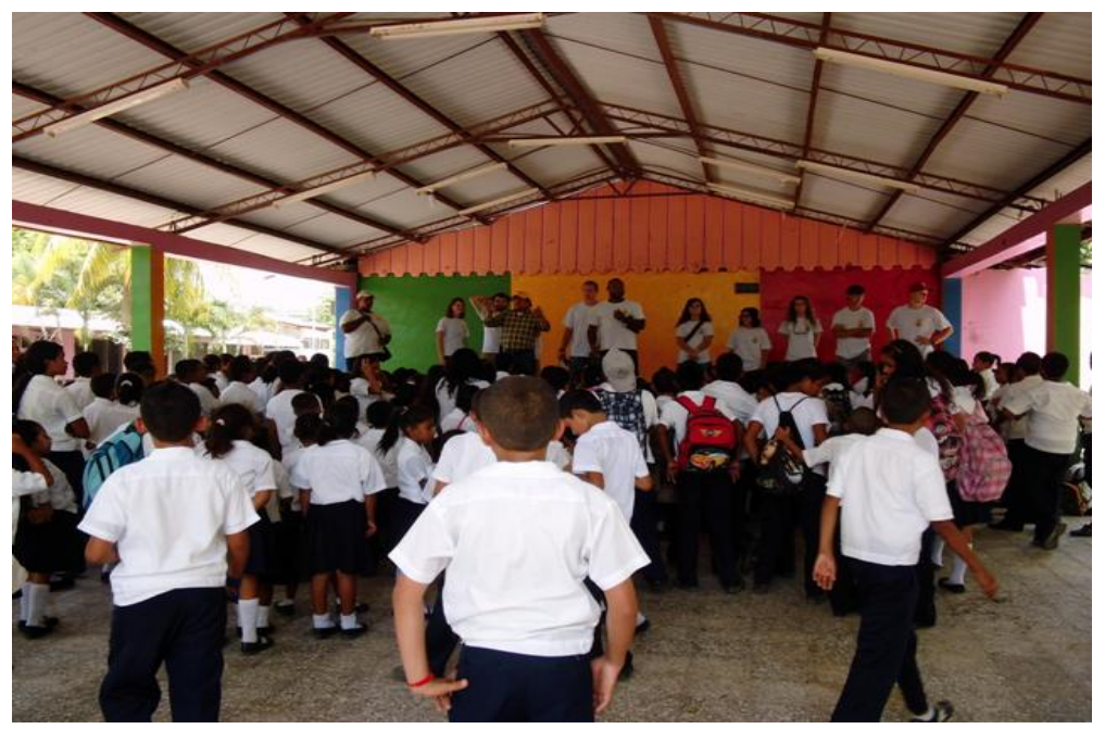
The Living Water Honduras team had the opportunity to interact with the students of the school throughout the week.