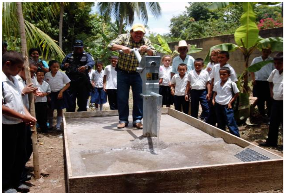
A member of the community tries out the new hand pump, while children from the nearby primary school observe.