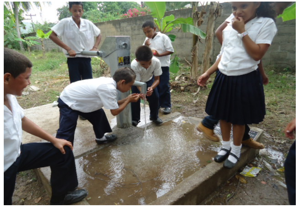
Students practice getting water from the new well.