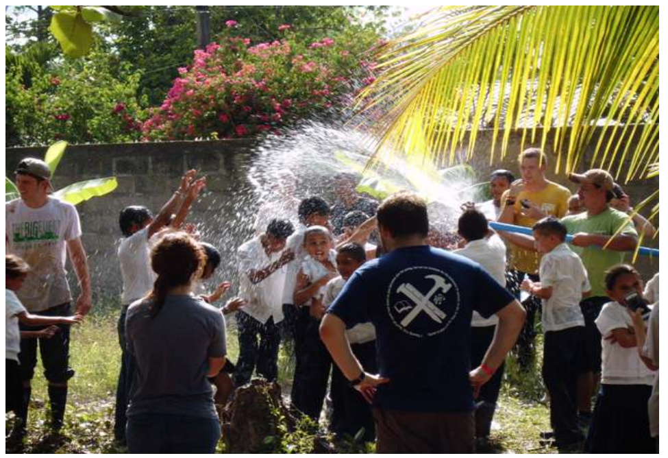
The children enjoy playing in the water as the well was being developed. In so many countries, children never get the opportunity to play in water as it is always so scarce.