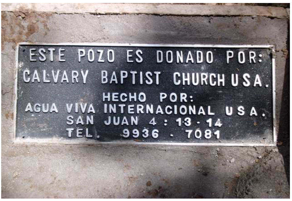
Close up of the plaque on the pump.