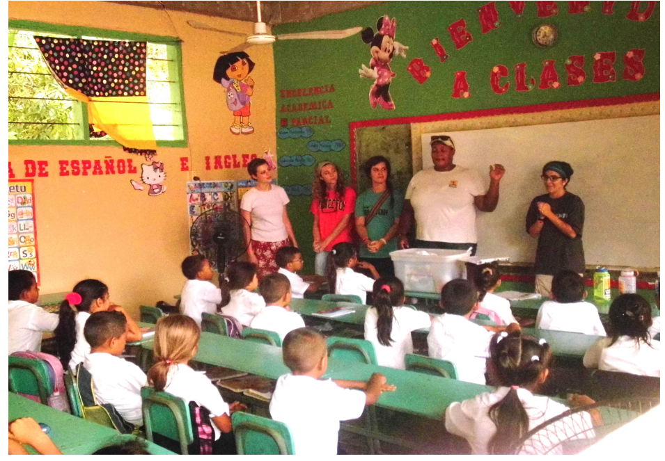
Additional hygiene lessons with the students.