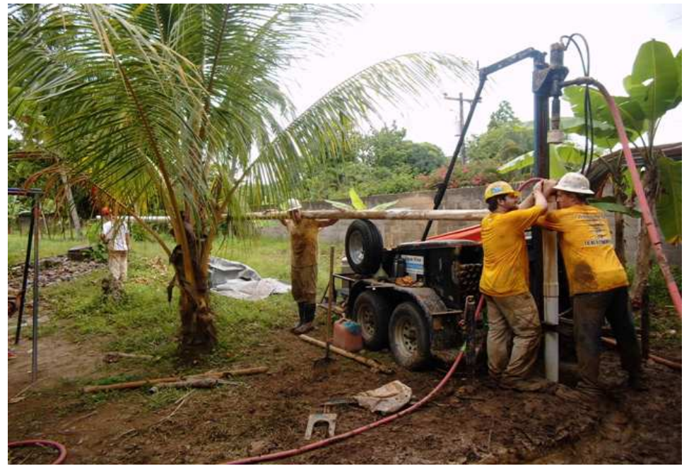
The team gets ready to develop the well.