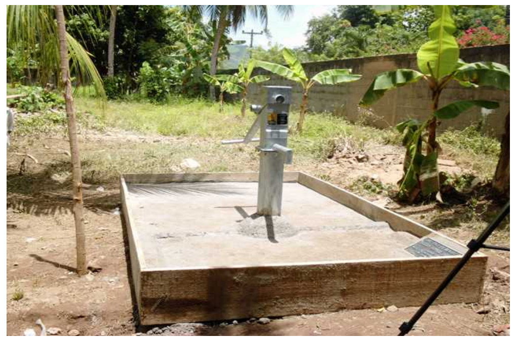
The completed water project with cement base, Afridev hand pump, and plaque.