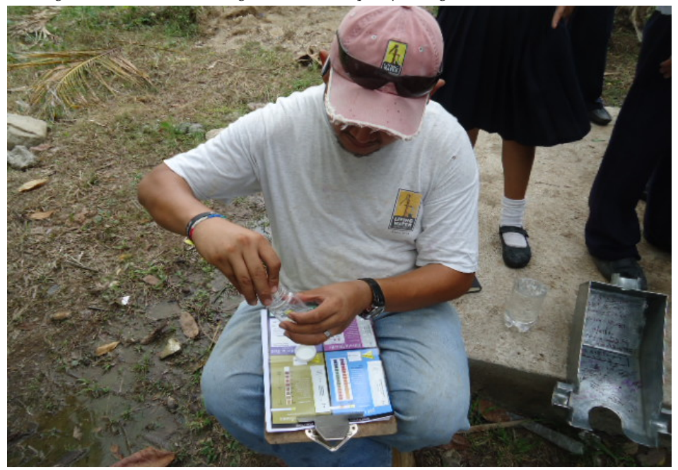
The water is tested for pH level, hardness, nitrates/nitrites, and the presence of coliform bacteria.