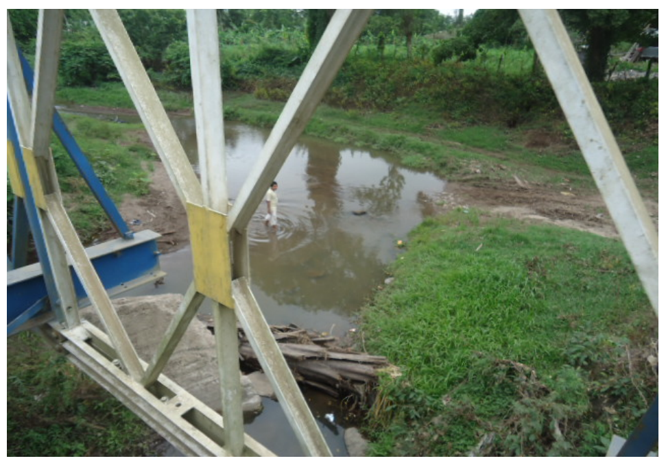
One of the previous water sources that the community relied on to meet their growing water needs.