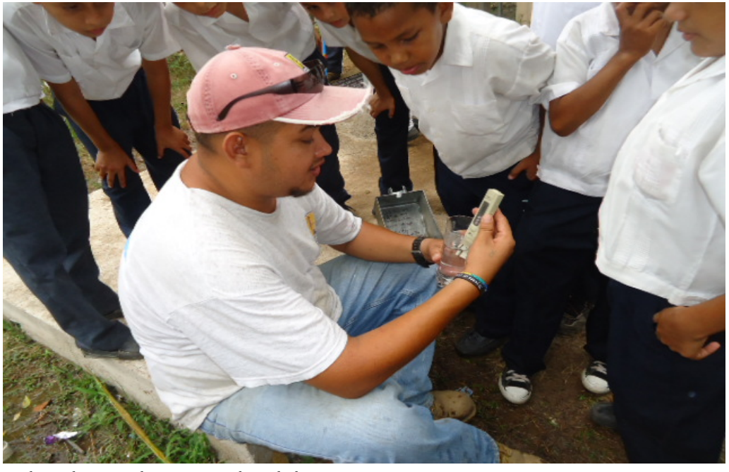
Students observe as the water goes through the various tests.