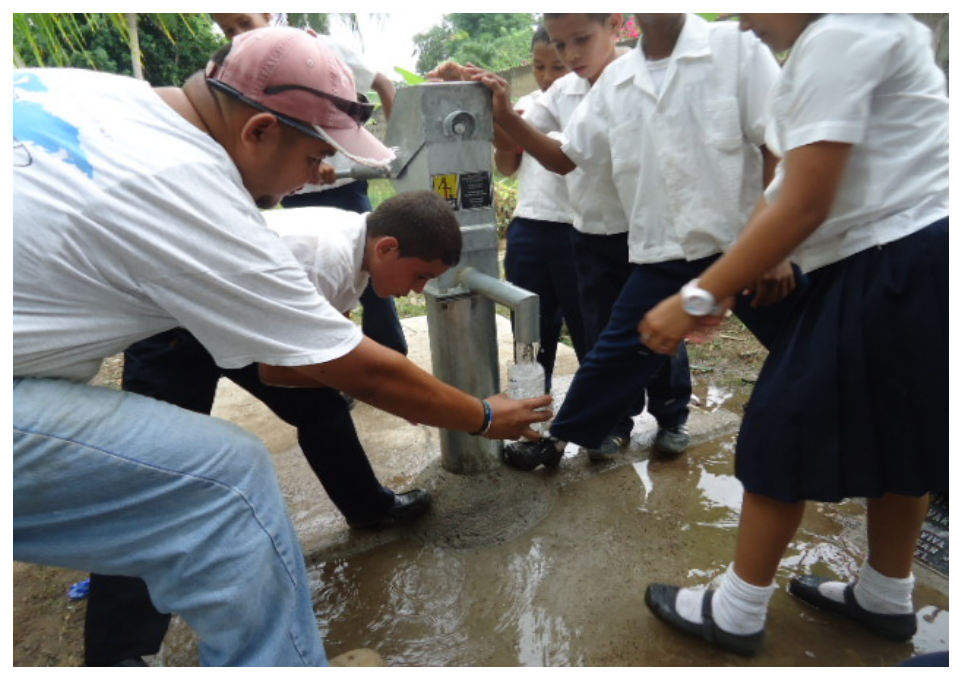
A Living Water Honduras member gathers water for quality testing.