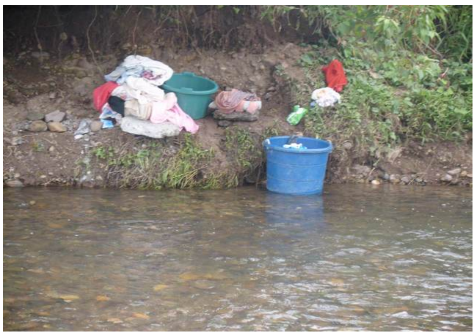
The community was forced to use surface water like this to meet all of their water needs.